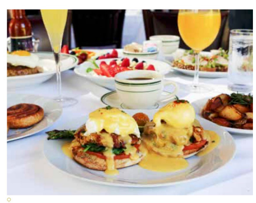
Wolfgang's Breakfast Benedict

To make a reservation, call (808 922-3600.)