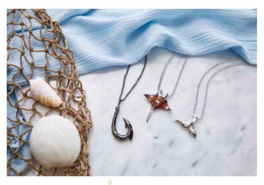
Laki Jewelry, A Mother's Day gift idea

End the day with a delicious dinner at one of our signature restaurants. Choose from local flavors or international cuisine—Royal Hawaiian Center has it all! Dine in and enjoy indoor and outdoor seating options at Doraku Waikiki (Bldg B, Level 3), Il Lupino Trattoria & Wine Bar (Bldg B, Level 1), Island Vintage Wine Bar (Bldg, Level 2), Noi Thai (Bldg, Level 3), Tim Ho Wan (Bldg B, Level 3), Tsurutontan (Bldg B, Level 3) or Wolfgang's Steakhouse (Bldg C, Level 3), or keep it casual with